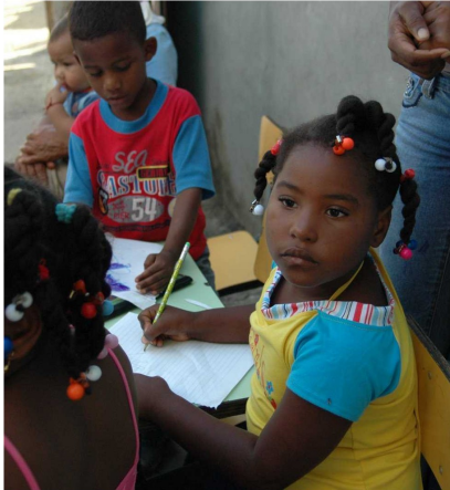
Children using School Kits

A light is shining in the lives of hundreds of families because of the tremendous effort put forth by 45 congregations within Blackhawk Presbytery! These families' children are receiving Church World Service School Kits because of the generous outpouring of CWS Kits collected at the November 9 presbytery meeting.