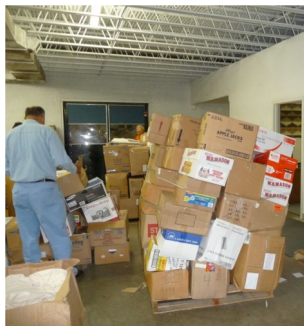
Kits arriving at the warehouse