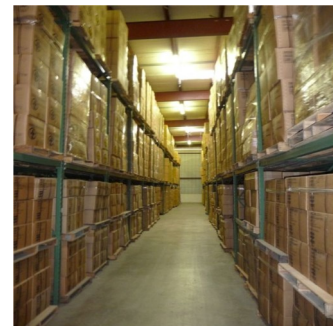
Kits ready to ship